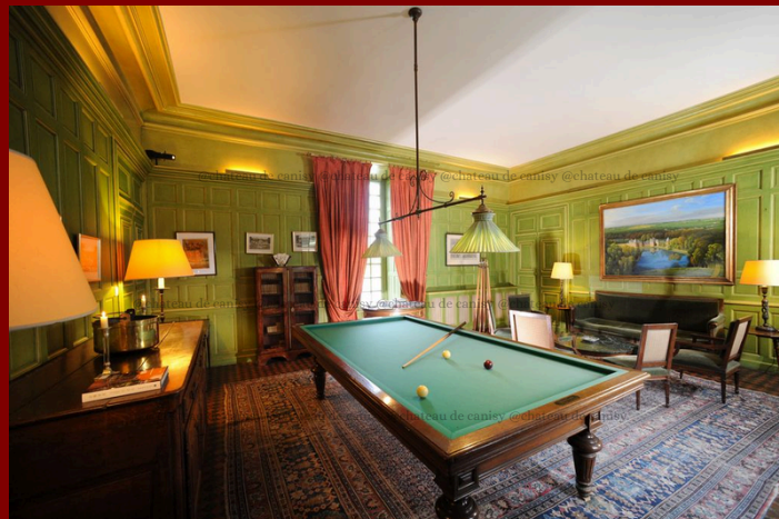
The Salon Carré

Enjoy the charm and romance of this salon decorated with the harp of Lily Laskine during your aperitif or cocktail.