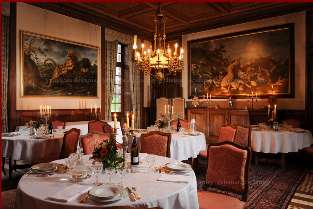
The Grand Dining Room