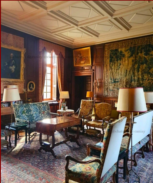
The Grand Salon

Intimate and convivial, the Grand Salon is perfect for aperitifs and cocktails.