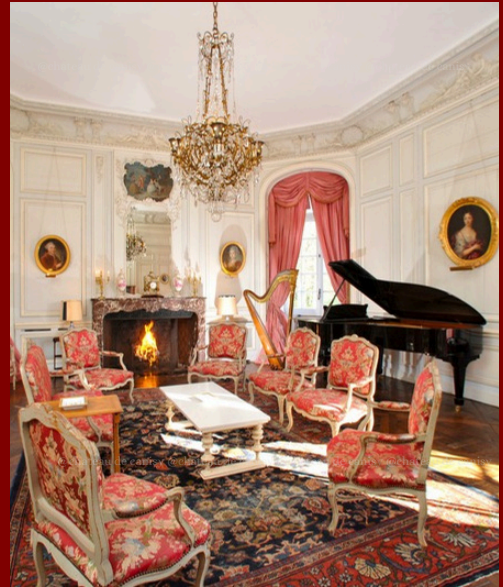
The Music Salon

Intimate and convivial, the Grand Salon is perfect for aperitifs and cocktails.