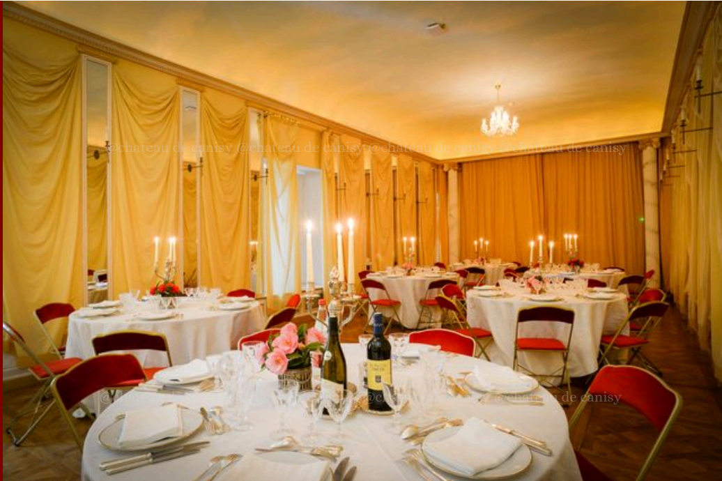
The Majestic Theater