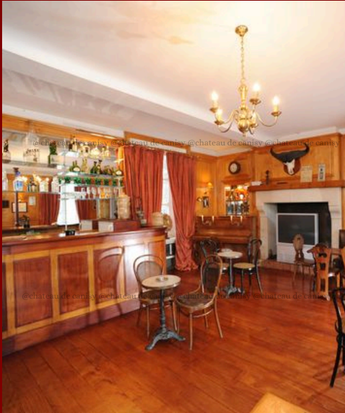
The English Bar

Take a well-deserved break or a cocktail in our pleasant and unique English bar.